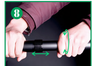
8 Adjust the top and bottom poles to the correct width.