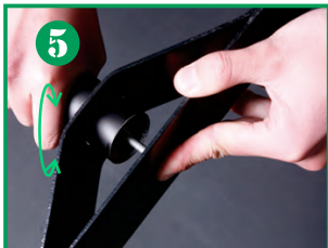
5 Repeat steps 3-4 with the other Steel Foot.