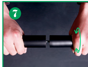
7 Connect top poles by finding the male and female pieces. Repeat for bottom poles.