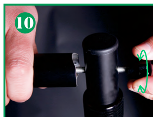
10 Connect the top pole to the left and right pole using the connector knobs.