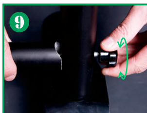
9 Connect the bottom pole to the left and right pole using the connector knobs.