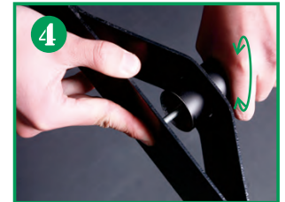
4 Screw one of the longer poles counter clockwise onto connector. Use your finger to hold steady.