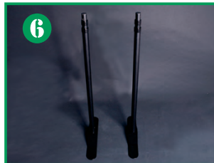
6 Place the Steel Feet with Poles on the ground next to each other as shown above.