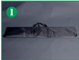
1 Bag containing hardware.