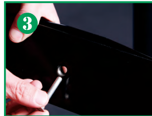
3 Slide foot connector through bottom of the hole on steel foot.