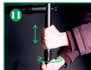
11 Adjust the left and right pole up or down to the correct height.